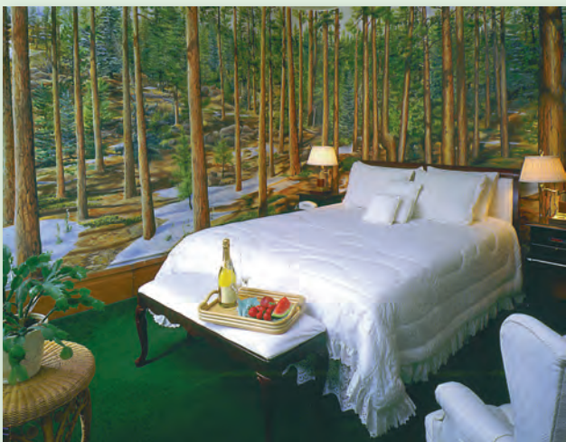
Snowlover Balcony Room

One of Denver's premier urban inns since 1994, the inn has eight distinctive guest rooms. There are three 2-room suites. Two rooms have balconies, two have fireplaces, three have whirlpool tubs, one has twin beds and four can accommodate more than 2 guests using a portable guest bed.