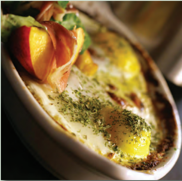
Full Gourmet Breakfast

One of Denver's premier urban inns since 1994, the inn has eight distinctive guest rooms. There are three 2-room suites. Two rooms have balconies, two have fireplaces, three have whirlpool tubs, one has twin beds and four can accommodate more than 2 guests using a portable guest bed.