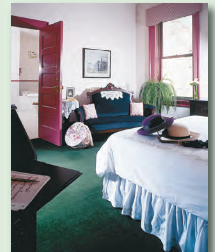
Shooting Star Balcony Room

Convenient to the parlor and dining room, this room has a king-size bed which can be made into twin beds, and a walk-in shower. It has both an overhead fan and an air-conditioner. Handicap accessible. First Floor